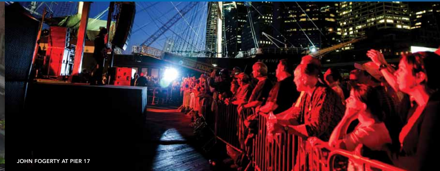
JOHN FOGERTY AT PIER 17