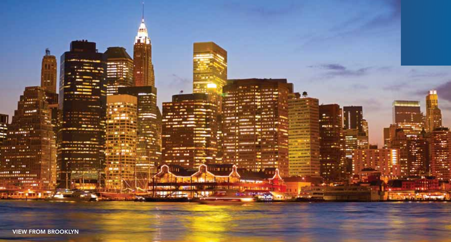
VIEW FROM BROOKLYN

South Street Seaport is a thriving Lower Manhattan neighborhood just blocks from Wall Street, City Hall and the World Trade Center, located where Fulton Street intersects with the East River, adjacent to the Financial District. With historic cobblestone streets and restored 18th Century row houses, nestled among New York's only historic tall ships moored along the East River. Three acres of waterfront Piers and expansive views north towards the Brooklyn Bridge and south to the harbor and Governor's Island — South Street Seaport is the premier location for your next event, filming or program.